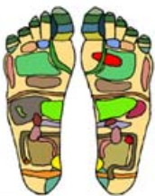
Sample of Chart

The colors represent the many areas connected with your body. This is almost like a 'map' of your body. Many charts vary due to copyright laws. It does not mean any one is better than the other is. However, this will give you an idea of what you may see hanging in a Reflexologist's room when you go in for a treatment.